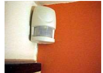
IR Movement Sensor